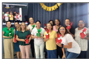
Ladies Auxiliary Meeting

Saturday was crammed-packed full of activities, beginning with the National Ladies Auxiliaries Meeting.