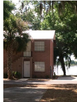
Ave F Property 2009