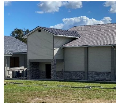
Fellowship Hall 2022