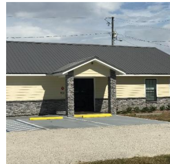
Westwood Mission School and Offices 2018